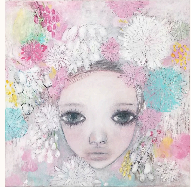
The Woman Who Wanted to Be a Flower